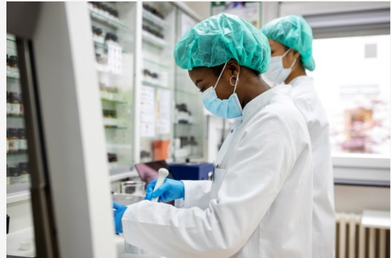
Caption Caption Caption

Posuere sollicitudin aliquam ultrices sagittis. Lacus laoreet non curabitur gravida arcu ac. Ullamcorper morbi tincidunt ornare massa eget egestas purus viverra accumsan. At augue eget arcu dictum varius dui at consectetur. In hendrerit gravida rutrum quisque non tellus orci ac. Mauris ultrices eros in cursus turpis massa. Eu scelerisque felis imperdiet proin fermentum leo vel orci porta. Vestibulum lorem sed risus ultricies tristique.